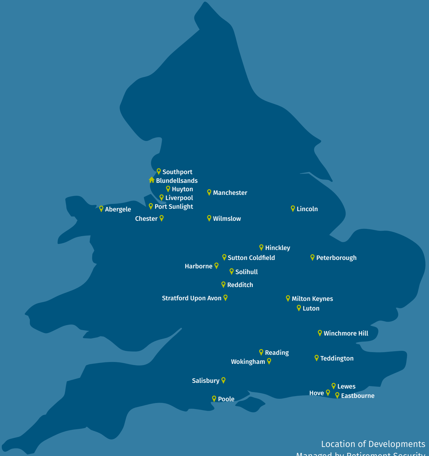
Location of Developments Managed by Retirement Security