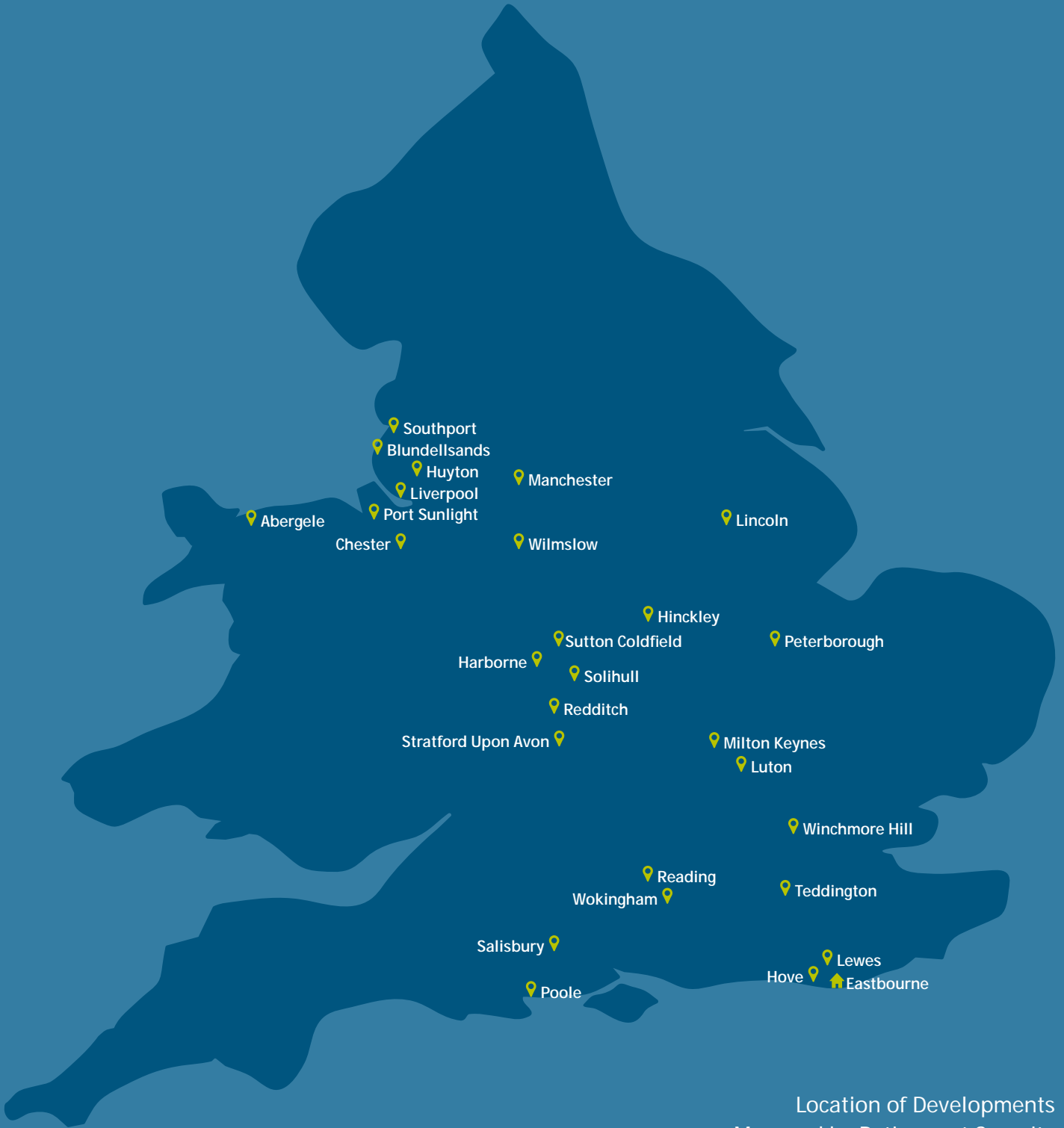
Location of Developments Managed by Retirement Security