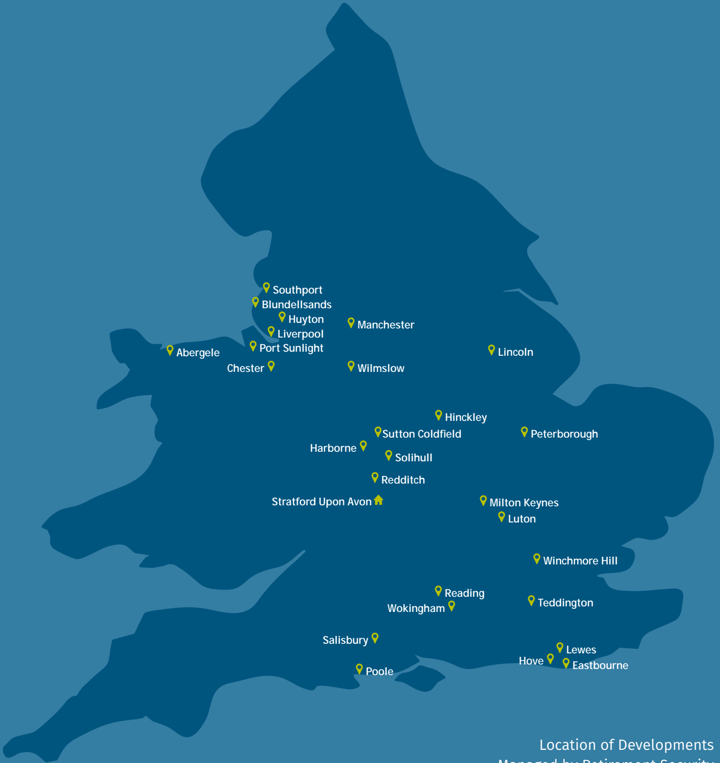
Location of Developments Managed by Retirement Security